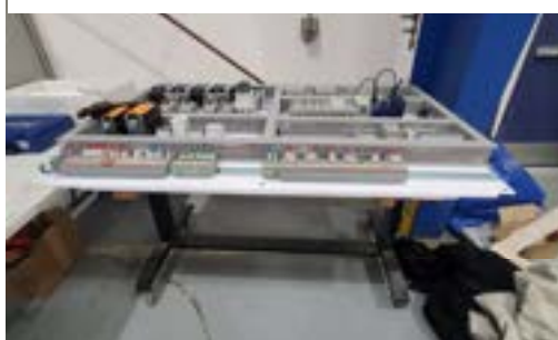
New control board for the hangar doors.

I am grateful for the trust placed in me as Education Officer, and I look forward to working alongside our volunteers to ensure Airbase Georgia continues to educate, inspire, and preserve the legacy we are entrusted to carry forward. ★