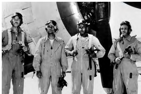
332nd pilots at the 1949 Air Force 'Top Gun' Aerial Gunnery Competition.

Online article https://www.military.com/history/tuskegee-airmen-won-first-air-force-top-gun-aerial-gunnery-competition.html