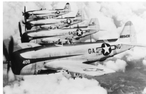
Right: Georgia National Guard P-47N-25 Thunderbolts photographed some time in 1949.