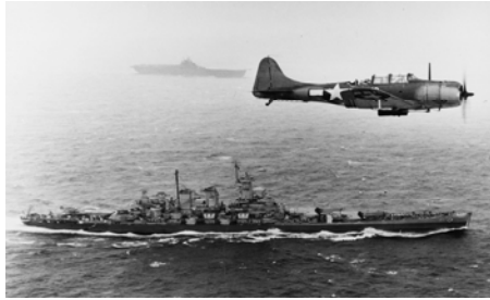
SBD-5 Flying over the USS Washington