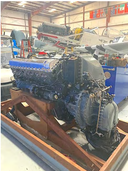
A good as new Merlin engine is uncrated and waiting to be switched out in the P-51 Mustang .