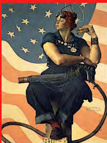
Artist: Norman Rockwell Saturday Evening Post May 29, 1943