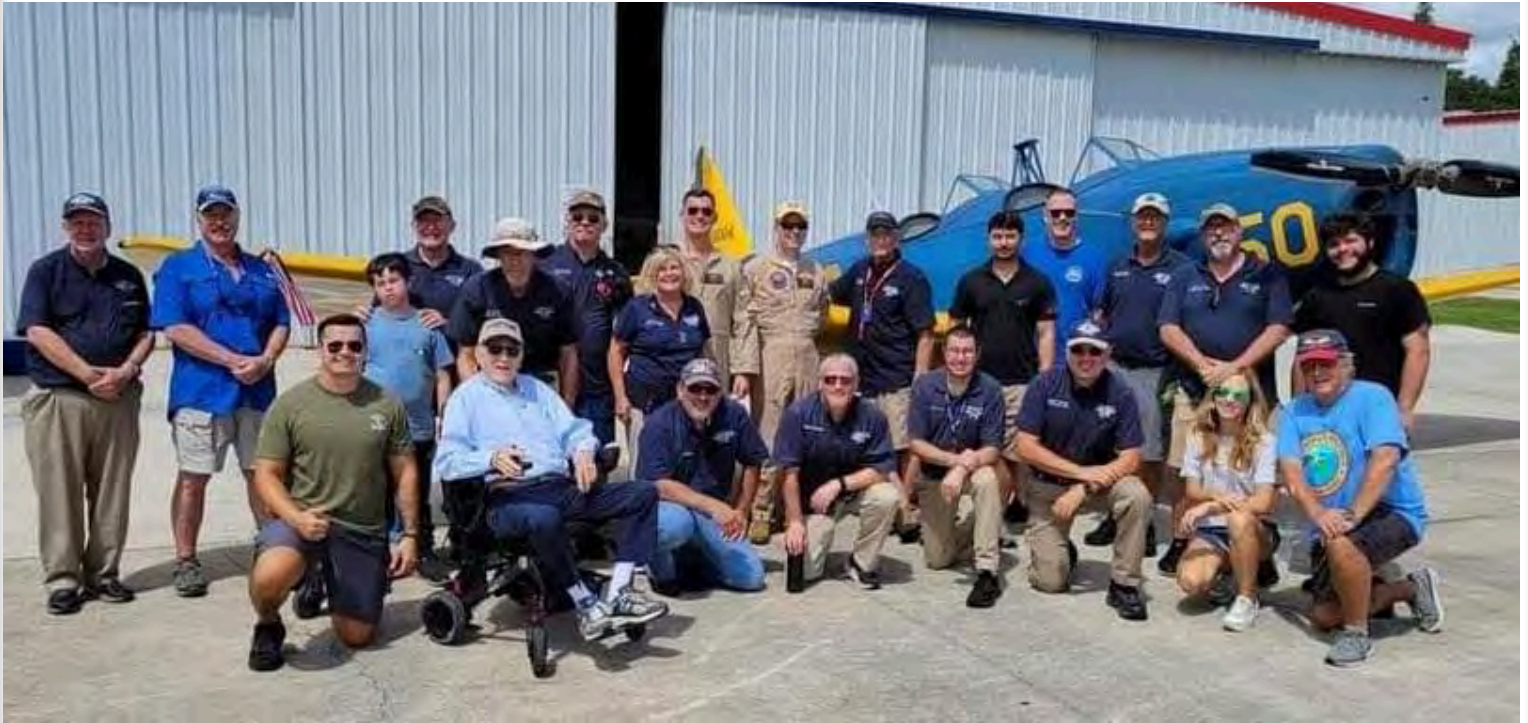
Photo of 21 Wing Member's present out of 39 members with our first Wing airplane in the background.