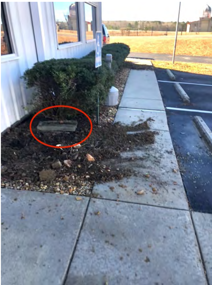
Old splash blocks: