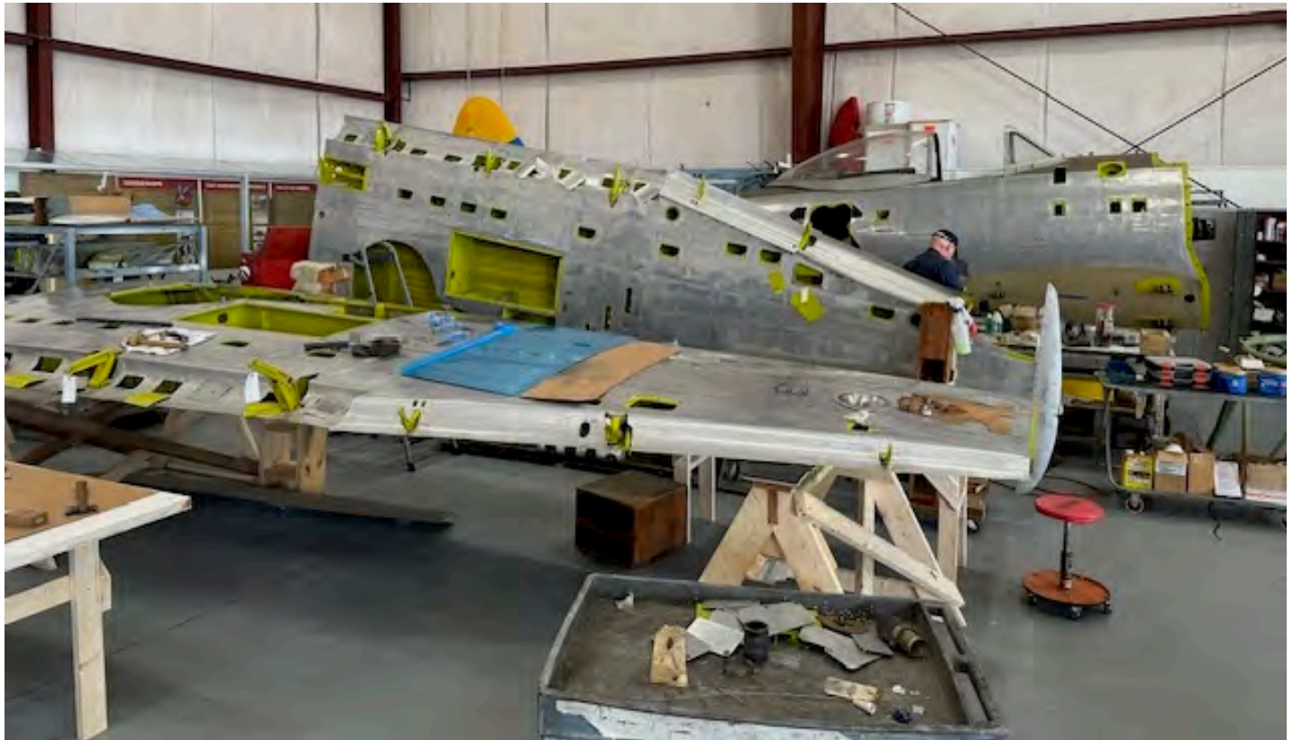
Col Dennis Beach working on the P-47.