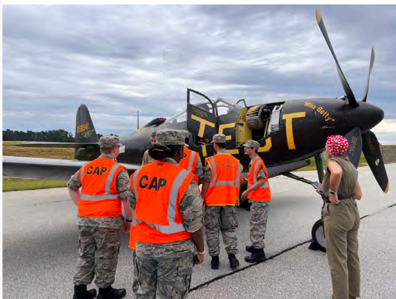
Attendees included members of the Civil Air Patrol.