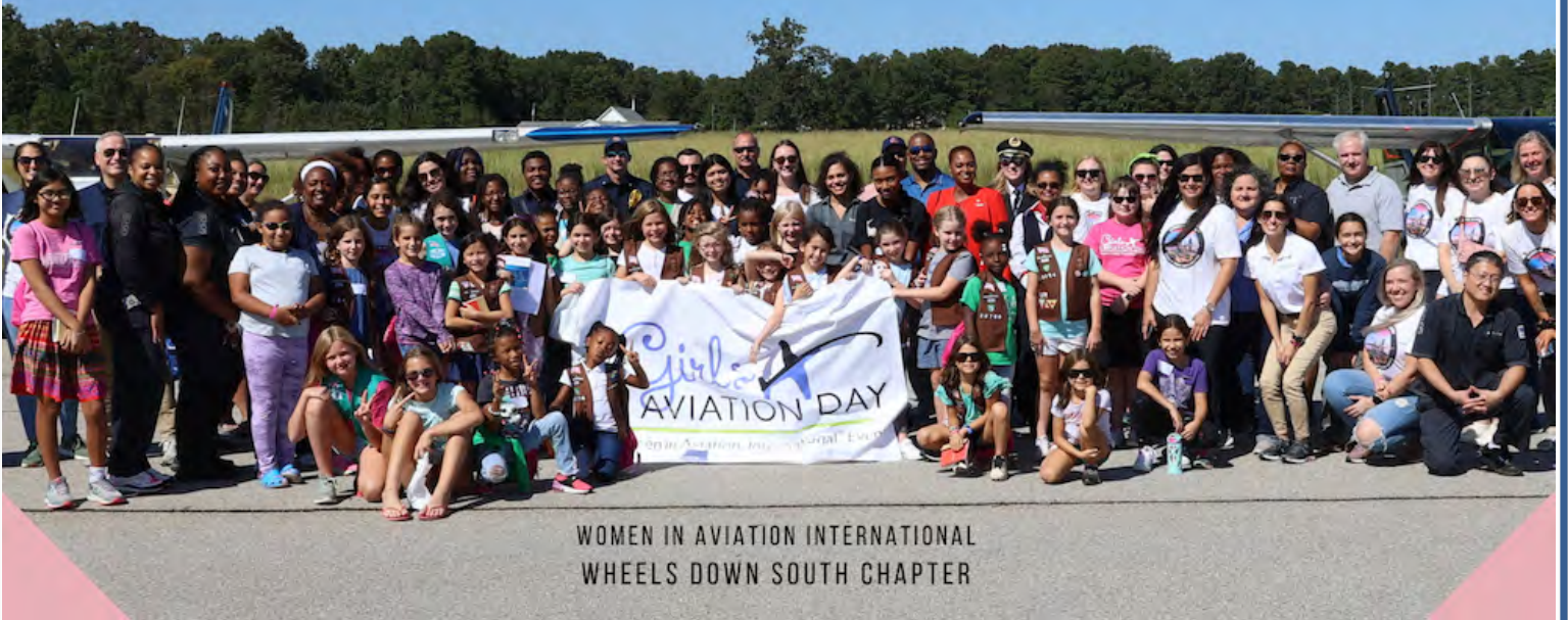
WOMEN IN AVIATION INTERNATIONAL WHEELS DOWN SOUTH CHAPTER