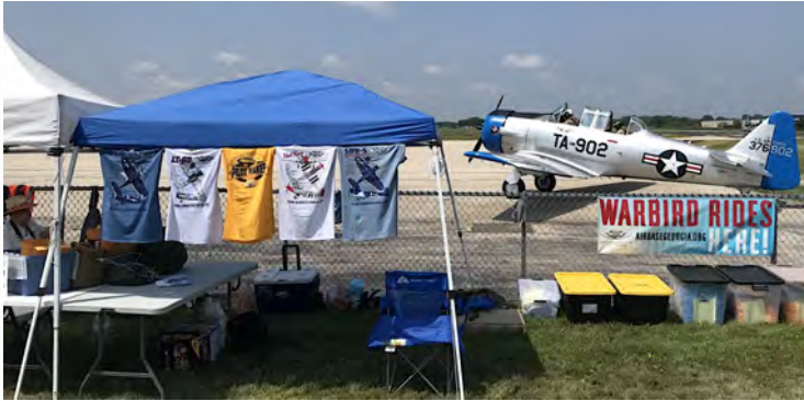
Left – Fond du Lac tent