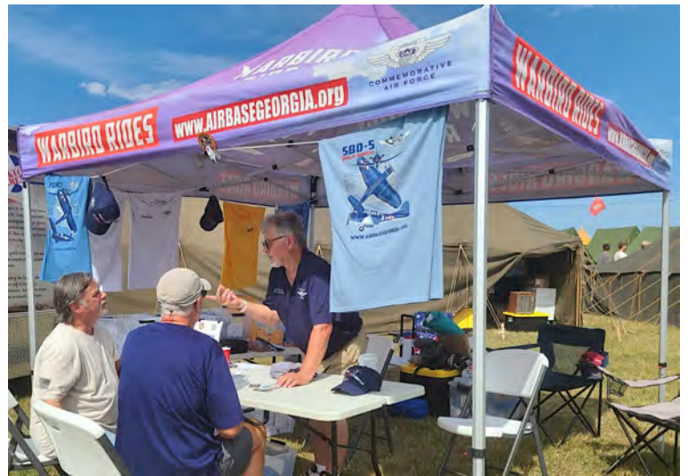
Right – Oshkosh tent

Airbase Georgia's outreach to the local community and those that traveled in was tremendous. The team gave countless tours of the airplanes at Oshkosh and Fond du Lac. This service fulfilled our mission to educate the public, honor the men and women that served, and inspire the public to keep the stories alive. We had lots of happy guests including those that shared their stories of family members who served in WWII.