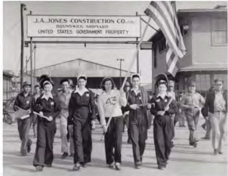
Shipyards employees, ca. 1943

In celebration of the fifth anniversary of our Home Front Museum, the Society will present four programs devoted to World War II topics. Our lectures will delve into the dramatically different wartime experiences in three nations – Britain, the United States, and France. The series will also examine one of the most significant and controversial achievements of the war, the development of the atomic bomb, as seen through the eyes of the brilliant scientist who headed the project. This series gives us the opportunity to invite back four exceptional speakers who presented popular programs in the past.