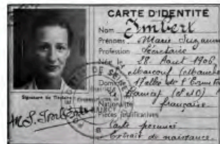
One of Marie-Madeleine Fourcade's false identity cards.