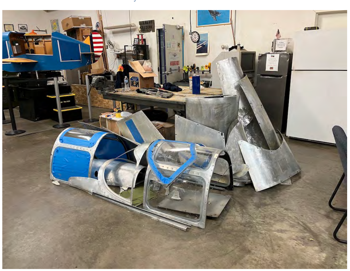
What has already been sanded.