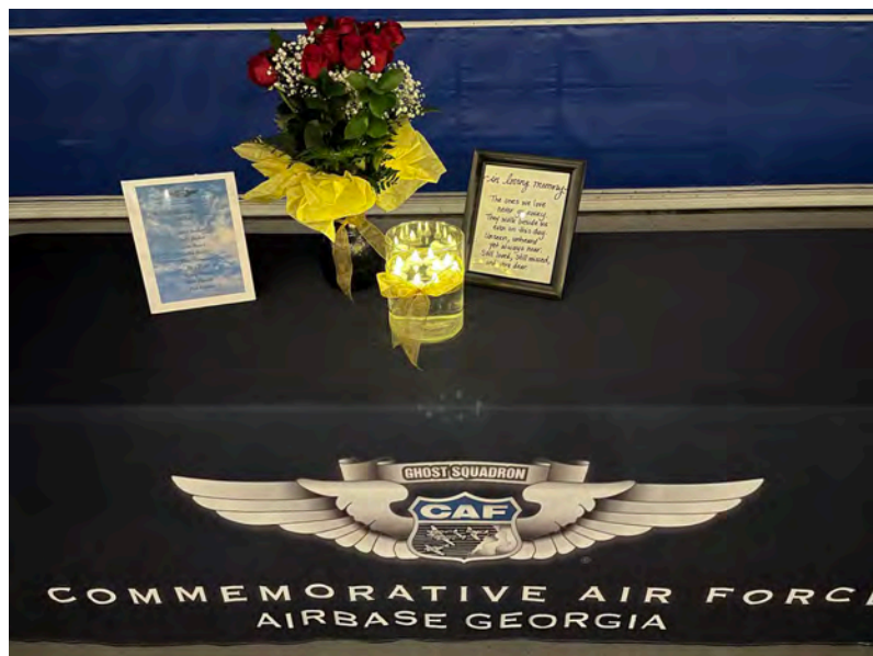
Right: Present at the party was the Airbase's Memorial Table for Cols lost over the past two years.