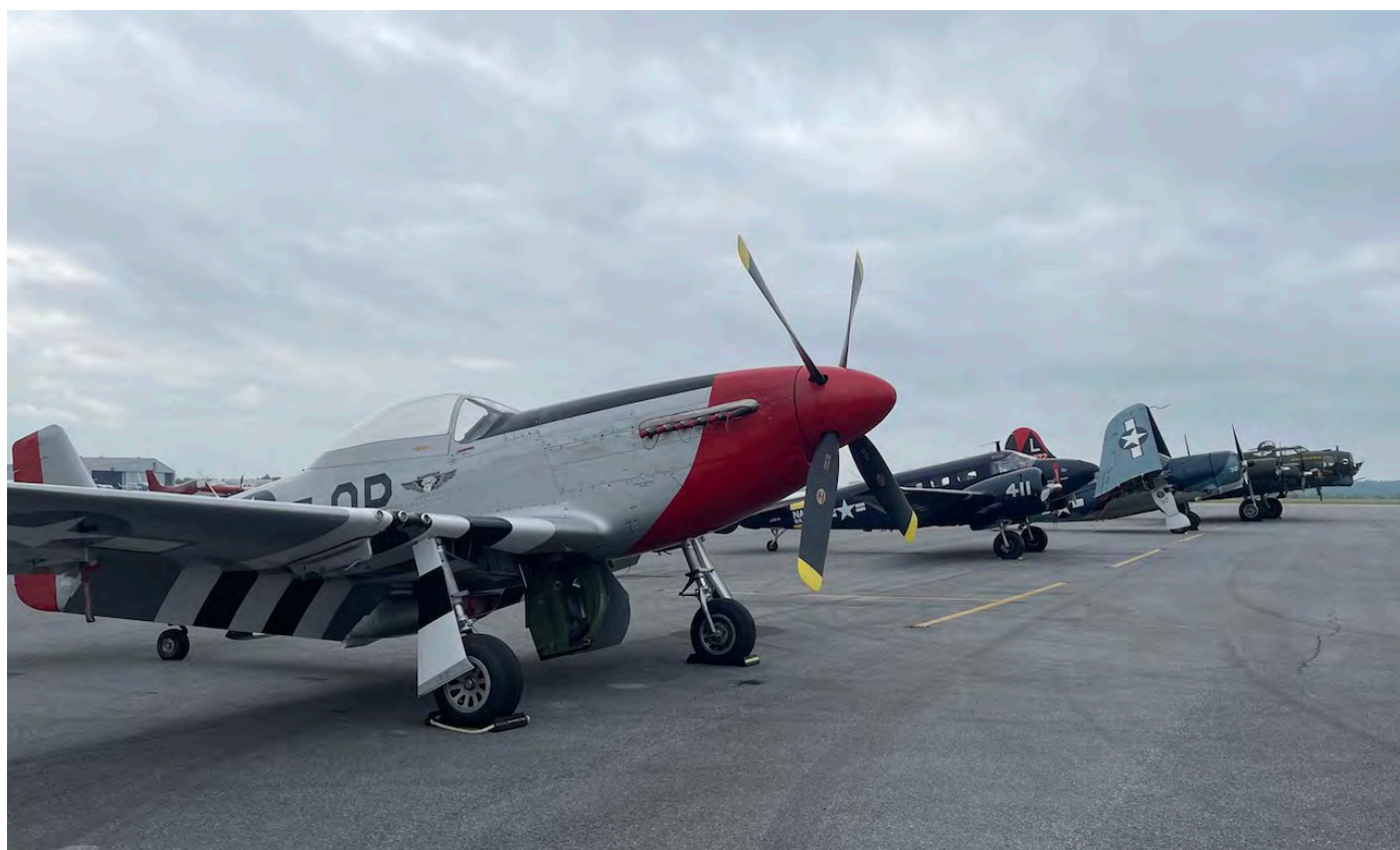
The starting lineup at Macon, GA with ships from the CAF Gulf Coast Wing.