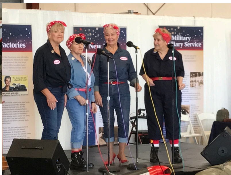
... as well as some reeanactors.