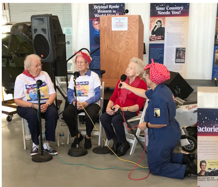
We had some real Rosies ....

Again, after a year's absence, participants enjoyed the WWII Heritage Day. Visit Airbase Georgia's Facebook page to see additional photos.